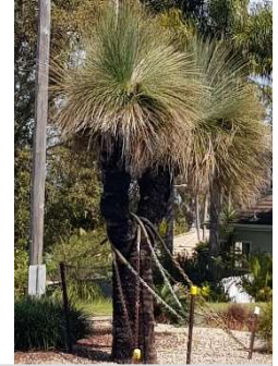
Still in chains in Port Macquarie

The first Virtual Annual Conference of the NSWACT AFHS was held last weekend (in case you missed it). We were amazed at the people from across Australia, New Zealand and other places in the world who attended. We chose the Zoom platform so people could get a 'buzz' from the conference. We found it allowed the speakers to interact with members of the audience while their talk was being presented and we are grateful to all the people who participated – especially the speakers who made the effort to not only prepare their talk but to log in and answer questions.